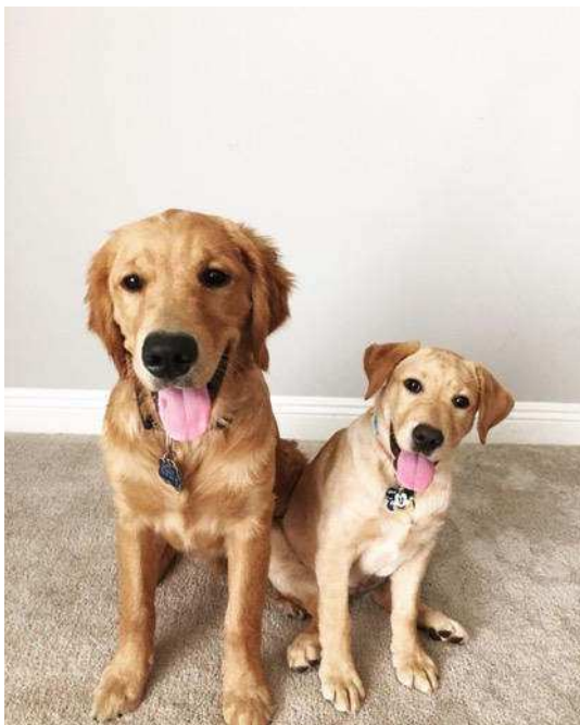
Orleans came over for a play date!