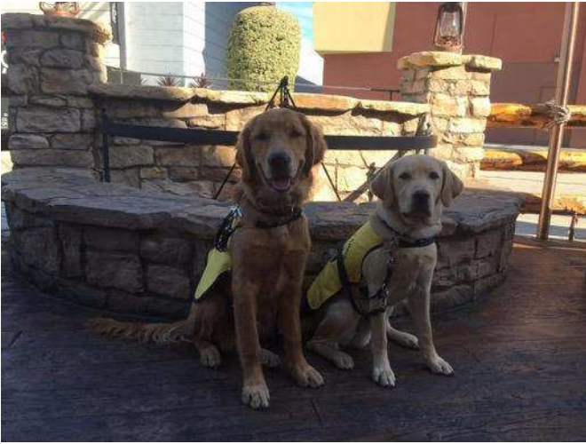
Kirby and I at the Orange Block!