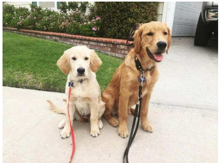
Aspen and I before our walk around Aspen's neighborhood!